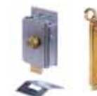
Various accessories page 194