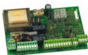
Control board 455 D Technical specifications page 149