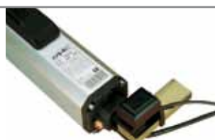
Gatecoder obstacle detection kit (with reversing function) Technical specifications page 161

Item code 712501001 to 712501036 Price (euro)