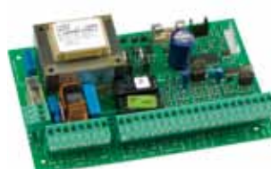
Control board 462 DF Technical specifications page 150