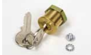
Release lock with customised key from no. 1 to no. 36

Item code 712501001 to 712501036 Price (euro)