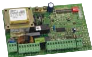
Control board 452 MPS Technical specifications page 148