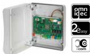
Control unit E 124 Tech. specifications page 160