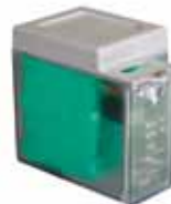
Emergency battery kit XBAT 24 (not for E 124)