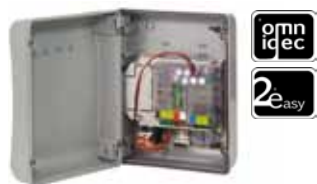
Control unit E 024S Tech. specifications page 159