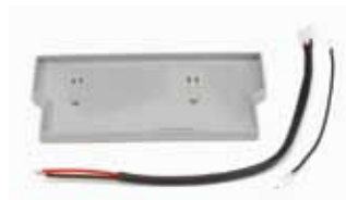
Emergency battery support kit* (only for E 124)