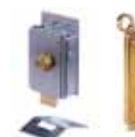
Various accessories page 176