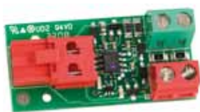
BUS XIB interface (if E024S board is used with non-BUS photocell)