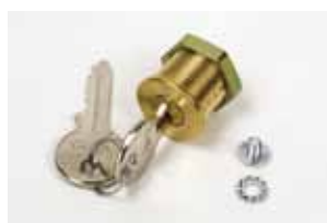
Release lock with customised key from no. 1 to no. 36

Item code 712501001 to 712501036 Price (euro)