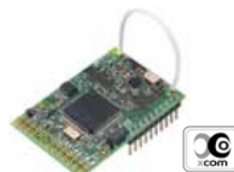
Receiving-transmitting module X-COM