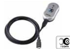
X-COM BOX module